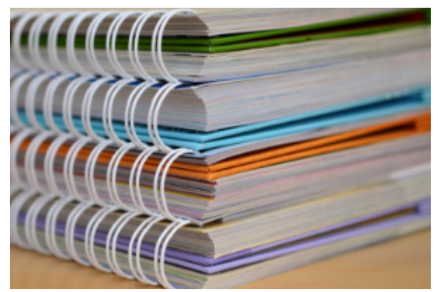
Why has the guide been created? The guide is one of three new resources being developed to upskill Advisors and

The guide is for people working with business students, early stage entrepreneurs and SME trainers.